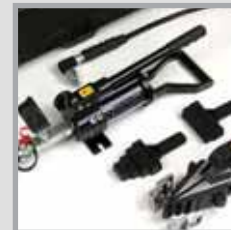
STANDARD KIT (SWi2025TESTDSPB)