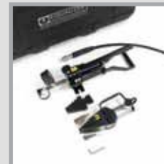
STANDARD KIT (SW15TESTDSPB)