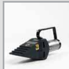
MINI KIT (SW15TEMIN)