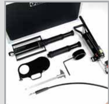
SG25TE KIT (collets supplied separately)