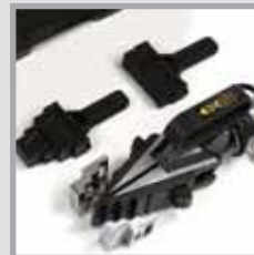
MINI KIT (SWi2025TEMIN)