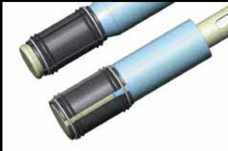
EXPANDING COLLET TECHNOLOGY

Equalizer International's Secure-Grip flange spreaders use our patented expanding collet technology for safe separation of flange joints with little or no access gap.