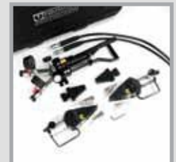
MAXI KIT (SW15TEMAXSPB)