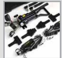
MAXI KIT (SWi2025TEMAXSPB)